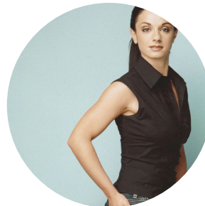
Daniela Mercuri Tap & Jazz